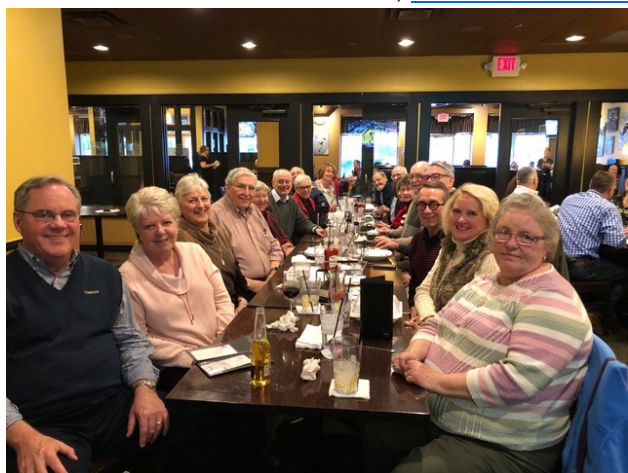
Kiwanis families having dinner following the Million Dollar Quartet performance at the Encore Theater in Dexter