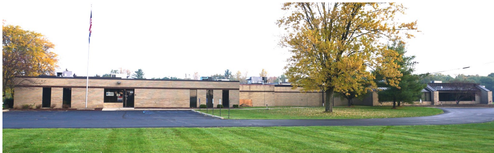
The Kiwanis Center

Interested in becoming a member? Please send an e-mail to MembershipGrowth@a2kiwanis.org or visit the website www.a2kiwanis.org .