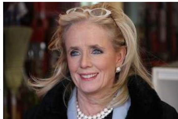
Congresswoman Debbie Dingell