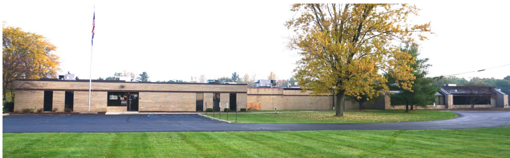
The Kiwanis Center

Interested in becoming a member? Please send an e-mail to MembershipGrowth@a2kiwanis.org or visit the website www.a2kiwanis.org .