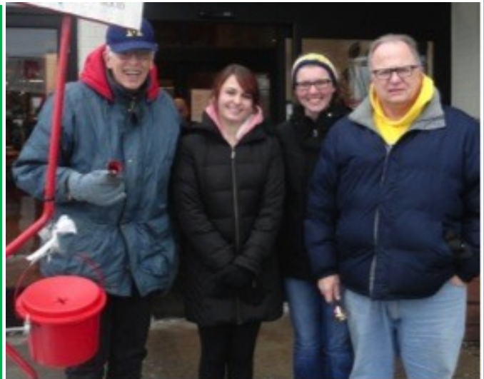
Family Bell Ringing Hits the Right Note!!