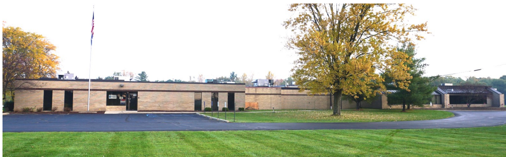
The Kiwanis Center

Interested in becoming a member? Please send an e-mail to MembershipGrowth@a2kiwanis.org or visit the website www.a2kiwanis.org .