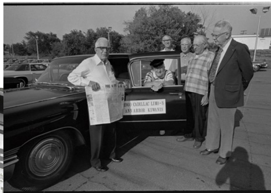
Kiwanis Club of Ann Arbor members with Cadillac "limo". August 1975. Who remembers this?