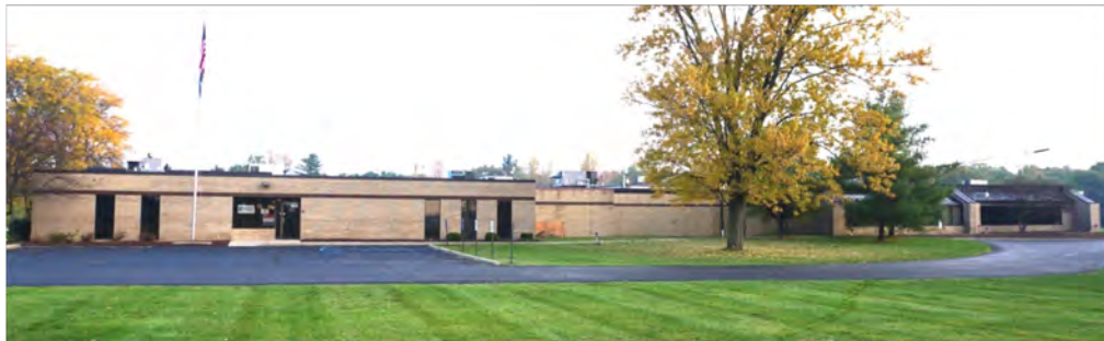
The Kiwanis Center

Interested in becoming a member? Please send an e-mail to MembershipGrowth@a2kiwanis.org or visit the website www.a2kiwanis.org .