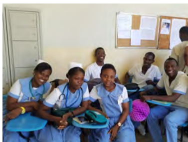
Current and newly graduated students at the Haiti Nursing School.

An anonymous Kiwanian has offered to match Kiwanis member donations to the Haiti Nursing Foundation up to $3,000. Donations may be made via a check payable to the Kiwanis Club of Ann Arbor Foundation, noting on your check that your generous contribution is for the HNF. You can learn more at www.haitinursing.org .