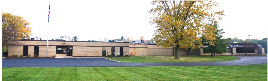
The Kiwanis Center

Interested in becoming a member? Please send an e-mail to MembershipGrowth@a2kiwanis.org or visit the website www.a2kiwanis.org .