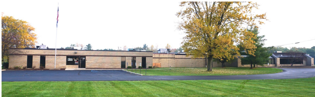
The Kiwanis Center

Interested in becoming a member? Please send an e-mail to MembershipGrowth@a2kiwanis.org or visit the website www.a2kiwanis.org .