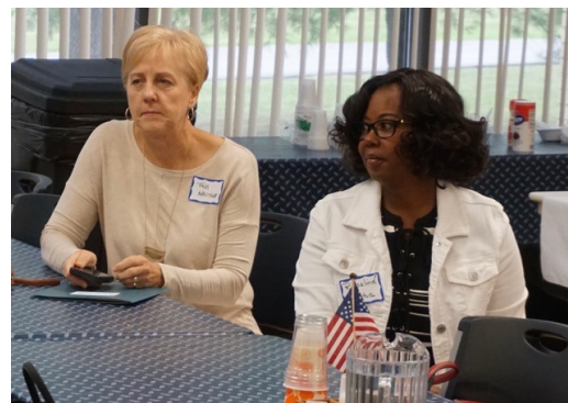
Guests at the Outreach Event.

Our Sponsored Programs in Service to Youth: