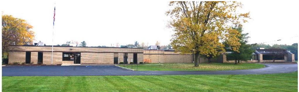
The Kiwanis Center

Interested in becoming a member? Please send an e-mail to MembershipGrowth@a2kiwanis.org or visit the website www.a2kiwanis.org .