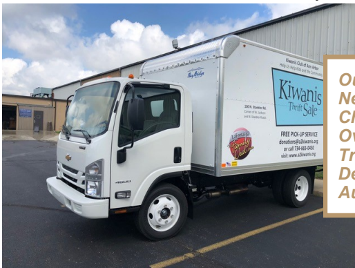
Our Snappy New 2018 Chevy Cab-Over Box Truck Delivered on August 8.