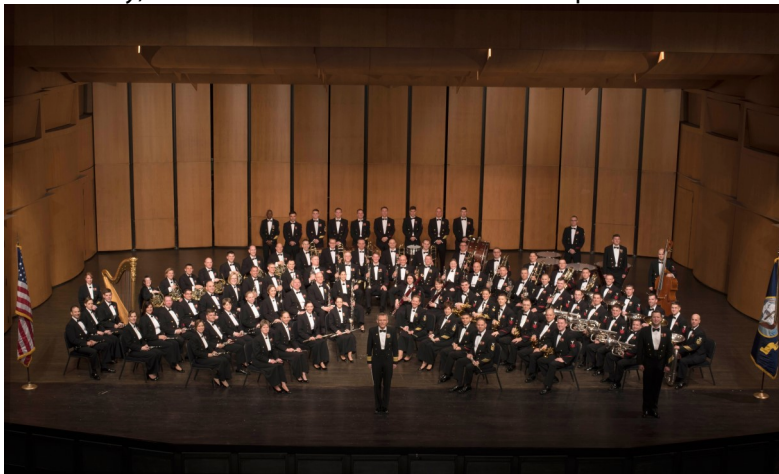
United States Navy Concert Band