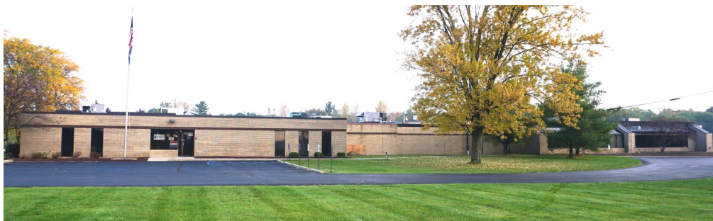
The Kiwanis Center

Interested in becoming a member? Please send an e-mail to MembershipGrowth@a2kiwanis.org or visit the website www.a2kiwanis.org .