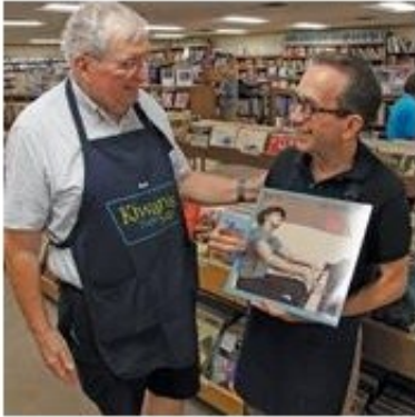
Click image for larger version.

The following article appeared in the November 2017 issue of the Ann Arbor Observer . Click here to see it on the Observer website.