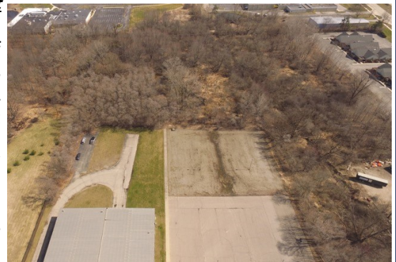
Drone View of the KCW KEEP Property Looking East (Above) and West (Below)