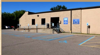
Kiwanis Center West