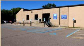
Kiwanis Center West