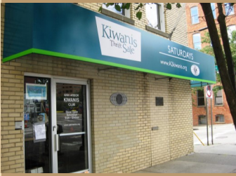
Kiwanis Center Downtown