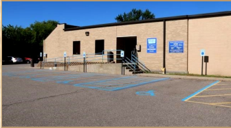
Kiwanis Center West

This is what we call HOME... now in our 94th year.