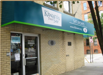
This is what we call HOME... now in our 94th year.