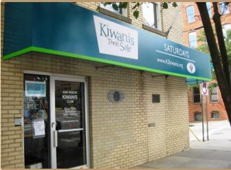
This is what we call HOME... now in our 94th year.