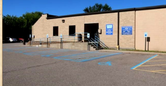
Kiwanis Center West