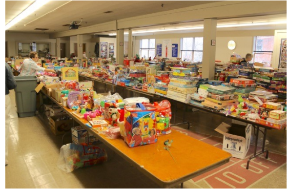
Getting ready for the record Christmas sale about 20 hours before the doors open.