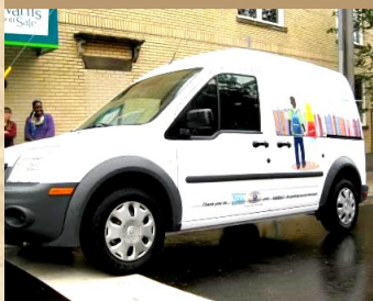
The Family Learning Institute "bookmobile" purchased with a $20,500 grant from the Kiwanis Club of Ann Arbor Foundation in 2014.