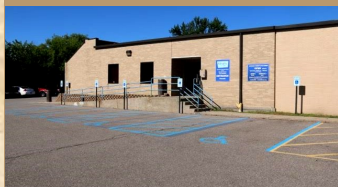
Kiwanis Center West

This is what we call HOME... now in our 94th year.