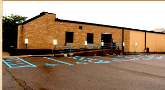
Kiwanis Center West