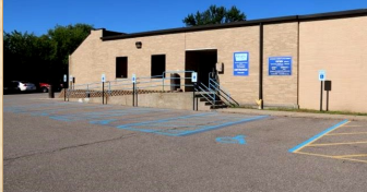
Kiwanis Center West

This is what we call HOME... now in our 94th year.