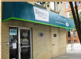
This is what we call HOME... now in our 93rd year.