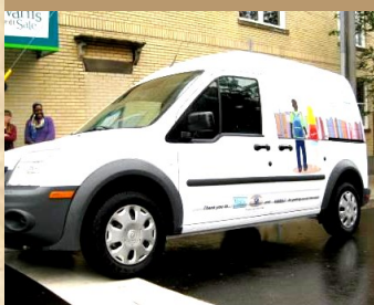
The Family Learning Institute "bookmobile" purchased with a grant from our club in 2014.