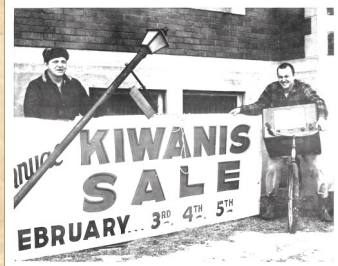
The Early Days

This is what we call HOME... now in our 94th year.