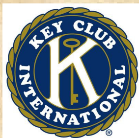
Huron High School Pioneer High School