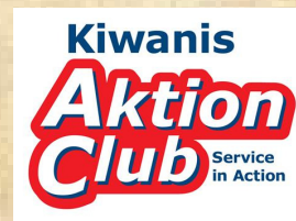
WISD Aktion Club