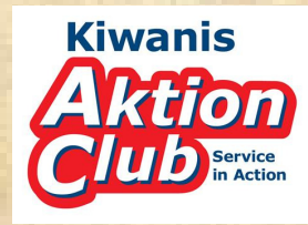
WISD Aktion Club