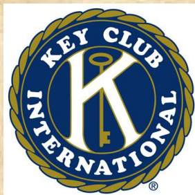
Huron High School Pioneer High School