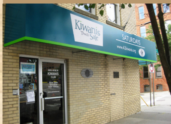
This is what we call HOME... now in our 93rd year.