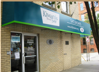
This is what we call HOME... now in our 93rd year.