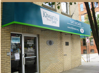
This is what we call HOME... now in our 93rd year.