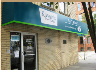
This is what we call HOME... now in our 93rd year.