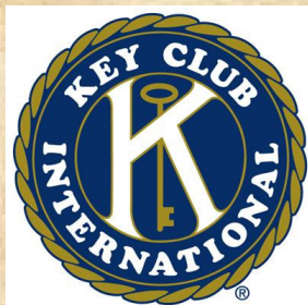
Huron High School Pioneer High School