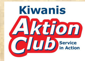
WISD Aktion Club