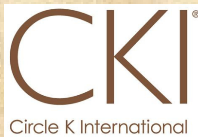
University of Michigan Circle K

ELIMINATE Kiwanis eliminating maternal/neonatal tetanus