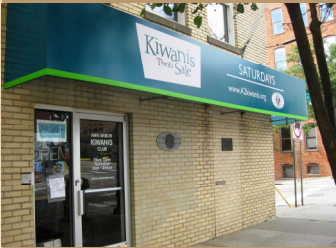
This is what we call HOME... now in our 93rd year.