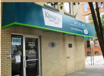
This is what we call HOME... now in our 93rd year.