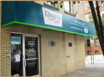
This is what we call HOME... now in our 93rd year.