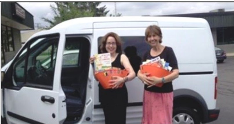
Washtenaw County literacy groups take reading on the road with new 'Bookmobile'

See the article regarding the Kiwanis grant as it appeared in the Ann Arbor News on June 28 at the following link: