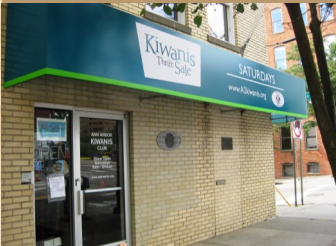
This is what we call HOME... now in our 93rd year.