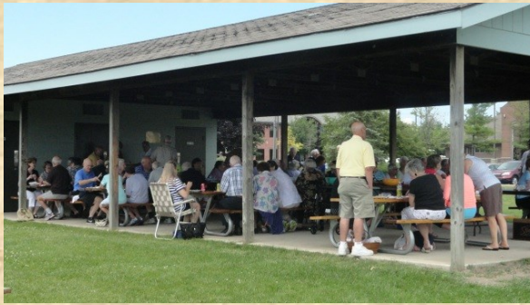
Kiwanis Club of Ann Arbor Picnic July 2014