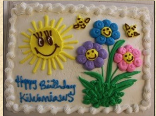
We celebrated this month's birthdays with a very spring-like cake!