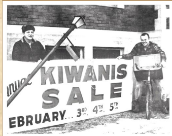
The Early Days