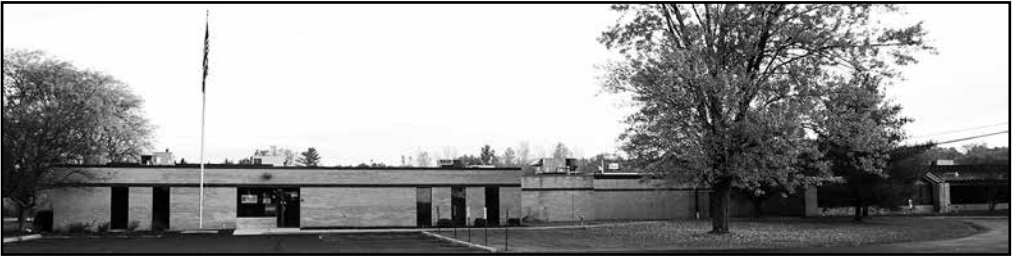
The Kiwanis Center