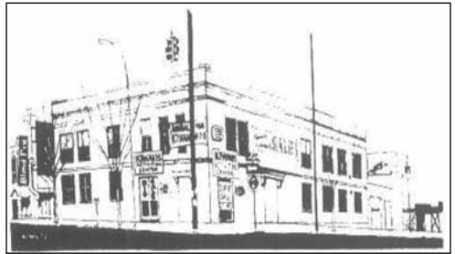
The Kiwanis Activity Center — 1966-2017