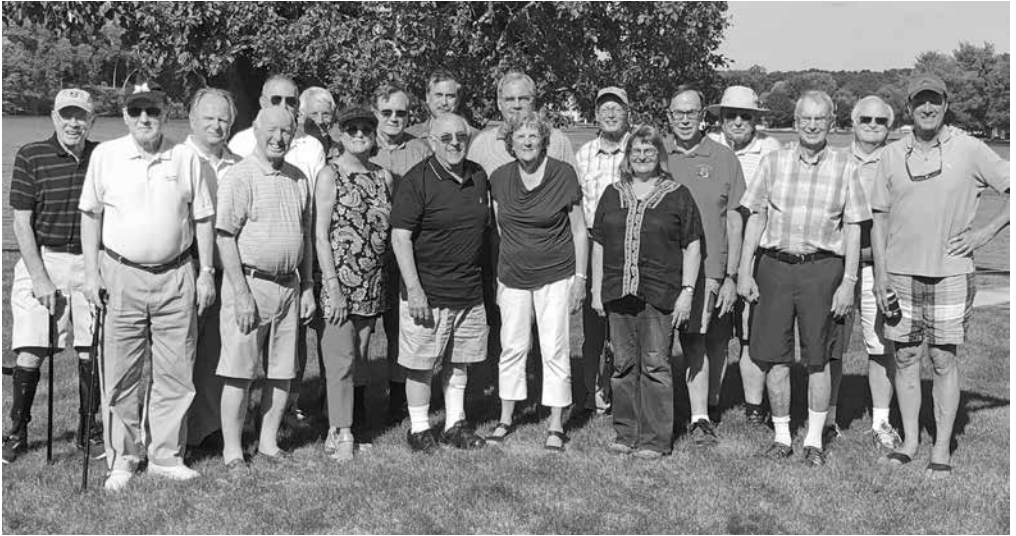
2019 Past Presidents Picnic, June 27, 2019.