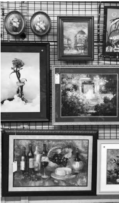
Just some of the fine art available at the Kiwanis Thrift Sale